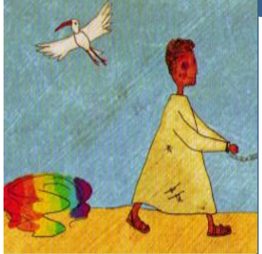
You intended to harm me, but God intended it for good. Genesis 50:20